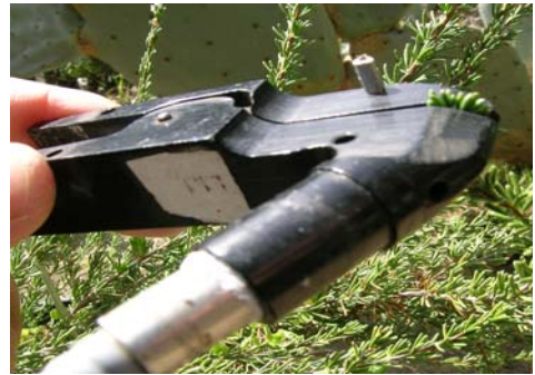
Figure 1. Close up of the UniSpec-SC connected to a bifurcated fiber optic and a leaf clip for monitoring spectral response of chaparral species at Sky Oaks Biological Field Station in Northeast San Diego County in southern California.