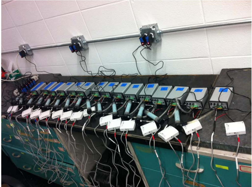
15 SBA-5 CO 2 Gas Monitors lined up for calibration checks prior to deployment

In the Hospital Microbiome Project, SBA-5 CO 2 analyzers are being used to measure a variety of building science parameters that may ultimately be used to explain some of the differences in microbial communities observed inside a new hospital as it becomes occupied and operates for an entire year.