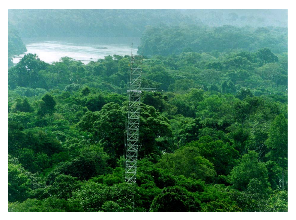
Figure 4. Rebio Jaru Tower Site (Rondonia – Brazil)

The profiling system described in this application note is located at the Rebio Jaru Tower Site (Rondonia, Brazil).