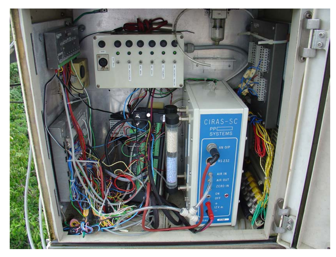
Figure 1. Profiling system based on the CIRAS-SC

Amazonia constitutes a large global store of carbon. Forest conversion in Amazonia is a net source of carbon to the atmosphere, while recent measurements indicate that undisturbed forest systems may be a net carbon sink. The importance of sequestration of carbon in regrowing forest and abandoned lands is unclear. These issues represent uncertainties in the global carbon balance and may influence the carbon dioxide concentration of the atmosphere and thus interact with the climate system. How will changes in land use affect the net carbon balance between terrestrial ecosystems and atmosphere, and do undisturbed forest ecosystems function as net carbon sink? What are the sizes of the carbon pools in the vegetation and soils of intact, secondary and selectively-logged forests, savannas, and agricultural lands? What are the net rates of carbon exchange between the atmosphere, vegetation and soil, and how are the size of the pools and the rates of exchange altered by natural and human disturbances?