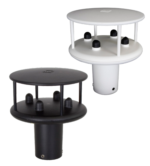
WindSonic ultrasonic anemometers offer high accuracy, low cost wind measurement