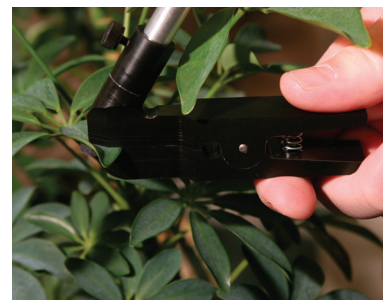
Leaf clip and bifurcated fiber optic