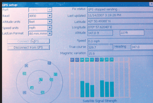
GPS satellite data