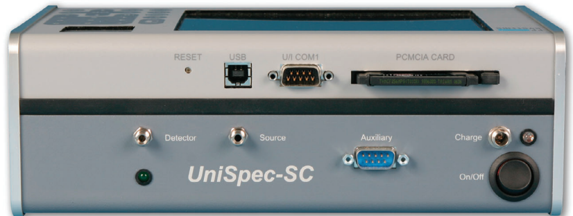
UniSpec-SC foreoptics interface (Detector and Source), serial and USB ports, PCMCIA port, auxiliary connector and system power.

Windows CE.NET is a registered trademark of Microsoft Corporation.