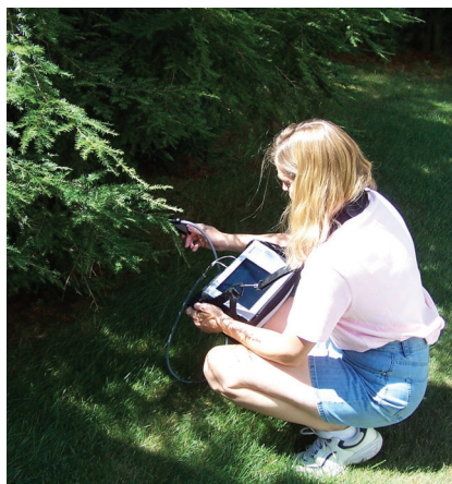
Leaf reflectance measurement in the field