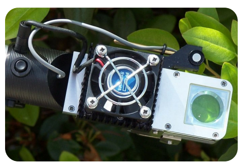
Close-up of PLC4 (B) leaf cuvette head

The PLC4 (B) leaf cuvette features a miniature sensor for accurate measurement of PAR (Photosynthetically Active Radiation) and an air temperature sensor.