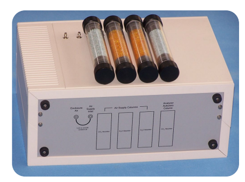
Self-indicating desiccants for analyzer zeroing and CO<sub>2</sub>/H<sub>2</sub>O control

The TPS-2 is also capable of controlling CO<sub>2</sub> at higher concentrations if used with an external gas cylinder.