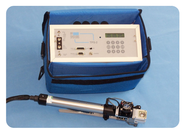
TPS-2 Main Console and Leaf Cuvette

Measurement of CO2 uptake is the most commonly used and easiest method for determination of photosynthesis in plants. Using infrared gas analysis techniques, we can readily determine CO2 concentrations to within 1 ppm and instantaneous, non-destructive measurements are possible. The TPS-2 passes a measured flow of air over a leaf sealed into a chamber called the "leaf cuvette". Using a "gas switching" technique, the TPS-2 first samples the CO2 and H2O of the air going to the cuvette (reference) and then the air leaving the cuvette (analysis). From the flow rate and the change in concentrations, the assimilation rate of CO2 and transpiration rate of water can be determined. This technique is commonly referred to as the "open" system method of measurement and is the method employed by the TPS-2. Designed for use under the most demanding field conditions (high temperature and humidity, dust), the system is equipped with an internal, hydrophobic filtering system ensuring that all internal parts are fully protected.